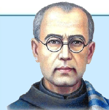
St. Maximilian Kolbe